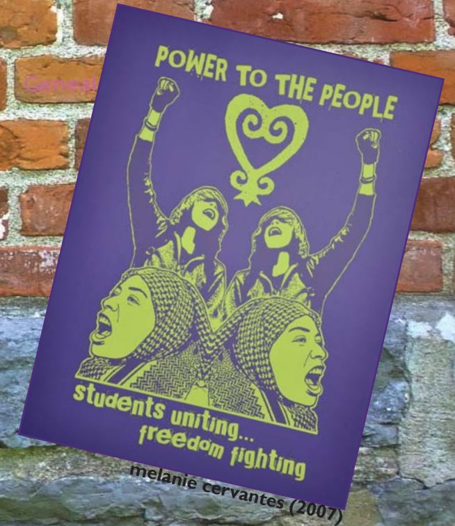
melanie cervantes (2007)