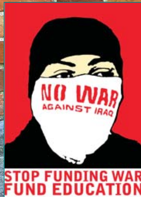
jesus barraza (2008)